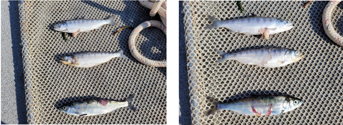
Figure 1: Mortalities found in gateway 1C on 8/25/23

bulkhead was removed, and an orifice inspection was performed to ensure the repairs were completed.